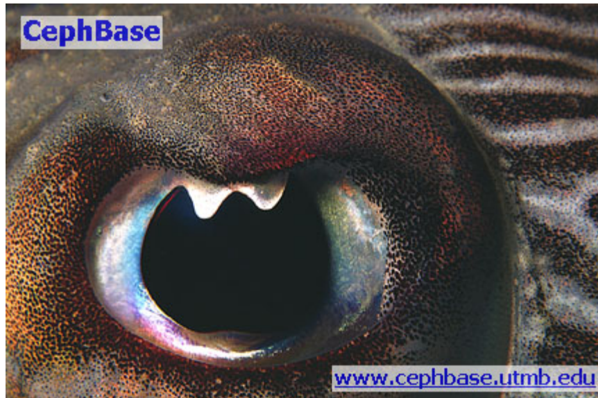
(Figure 2: The eye of a common cuttlefish, Sepia officinalis.)

Cephalopods are invertebrates and other than being multicellular animals, they are not even closely related to vertebrates such as whales, humans and fish. Cephalopods, and their eyes, evolved independently. Why would animals so distantly related as a fish and a cephalopod have developed an eye that is so similar?