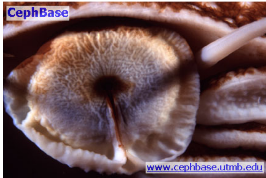
(Figure 3: The eye of Nautilus is simple and does not focus an image.)

It is hard to say why the Ammonites and all but 6 species of Nautilus have become extinct. These cephalopods had a wide variety of external shells, some coiled, some long and straight, some with spines. These shells provided good protection from predators but inhibited the animals' mobility. Predation pressure has long been thought to be one of the major forces driving cephalopod evolution. Perhaps as species of bony fish, many of which swim much faster than an externally shelled cephalopod, appeared in the early oceans, armor just wasn't enough, and of those species that depended on armor, almost all have become extinct.