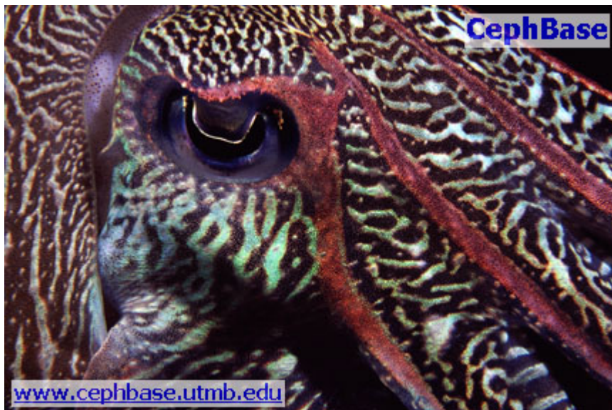
(Figure 7: The reds and blue-greens in this zebra display of a male Sepia pharoonis are created by iridophores. This is what we see. I wonder what would this pattern would look like to another cuttlefish?)

Cephalopods can use their ability to see polarized light in many ways. Firstly, it is thought that they can see through the reflection created by silvery fish scales to better identify prey and predators (Cronin and Shashar 2001). Often this reflection is polarized. Just as humans put on polarized sunglasses to see through the glare created by polarized reflection off the surface of the ocean, the cephalopod can cut out the glare of polarized light produced by reflection off fish scales to better distinguish prey. Translucent prey may also be more visible for the same reason, as light reflecting off the tissues of the prey may be polarized, and while it may not produce glare, it would make the prey animal more visible to animals that can see this reflection such as cephalopods.